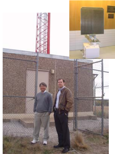
Oklahoma: atmospheric sensing net