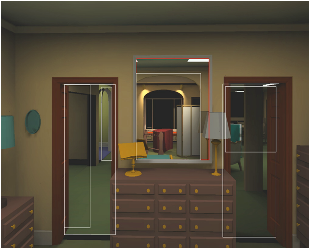
Plate 1. View from the master bedroom of the Brooks House showing cull boxes for portals (white) and mirrors (red).