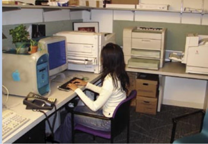
Alloy checked a software program that finds printers on wireless networks.

the exception of Romeo and Juliet, no Capulet should be seated next to a Montague. The assertions say that the system can never get into certain undesirable states and that specific bad sequences of events can never occur.