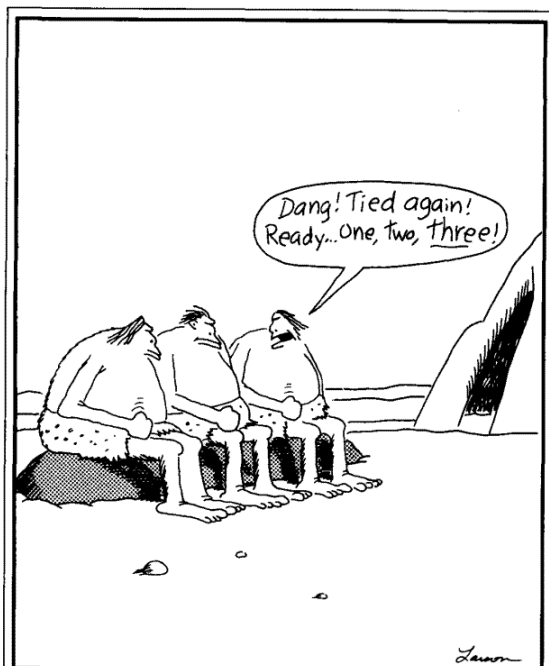
Before paper and scissors

Advice: Please try to solve the easier problems first (where the meta-problem here is to figure out which are the easier ones. ☺ ) Please don't spend too long on any single problem without also attempting (in parallel) to solve other problems as well; this way, the easiest problems (at least easier for you) will reveal themselves much sooner (think about this as a “hedging strategy”).