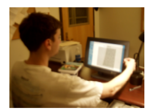
Figure 2. The screen image and transparency are random dots before aligning.

continue with the voting process without also verifying the server is legitimate.