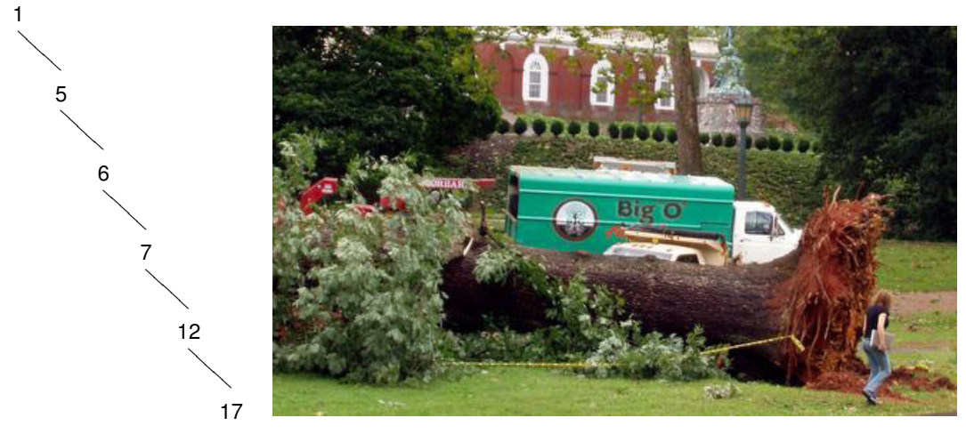
Figure 8.1. Unbalanced trees.

Exercise 8.7. Define a procedure binary-tree-size that takes as input a binary tree and outputs the number of elements in the tree. Analyze the running time of your procedure.