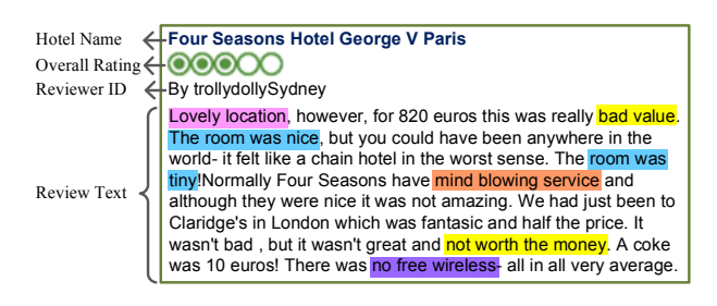
Figure 1: A Sample Hotel Review

to alleviate this problem including extracting information from reviews [18, 16, 26], summarizing users' opinions, categorizing reviews according to opinion polarities [20, 6, 7], and extracting comparative sentences from reviews [12, 13]. Nevertheless, with the current techniques, it is still hard for users to easily digest and exploit the large number of reviews due to inadequate support for understanding each individual reviewer's opinions at the fine-grained level of topical aspects.