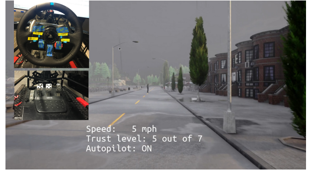
Fig. 3: Driving simulator setup.

The vehicle started driving in autopilot mode. When the vehicle approached an incident, the participants can decide whether to take over the vehicle to handle the incidents on the road. Should the participant choose not to take over, the vehicle will remain in autopilot mode to handle the incident. At any point during the experiment, the participant has the option to assume control of the vehicle and switch to manual driving. Should the participant choose to take over, he/she was required to switch back to autopilot mode before arriving at the next intersection so that the vehicle can choose the next direction to go. We asked the participants to periodically record their trust in the AV using the buttons