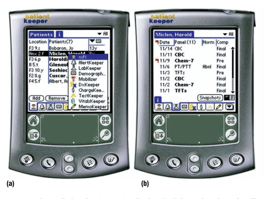
Figure 1. Palmtop displays showing a patient list downloaded onto the palmtop for office visits or rounds: (a) the system function menu and (b) laboratory results display screen.